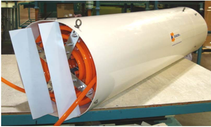
Two sizes available: 14" and 16"